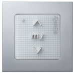
Silver Matte Part #: 9015025