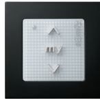
Black Part #: 9015023