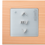
Light Bamboo Part #: 9015027