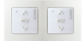
Double Pure Part #: 9015238