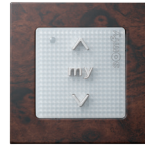
Walnut Part #: 9015237