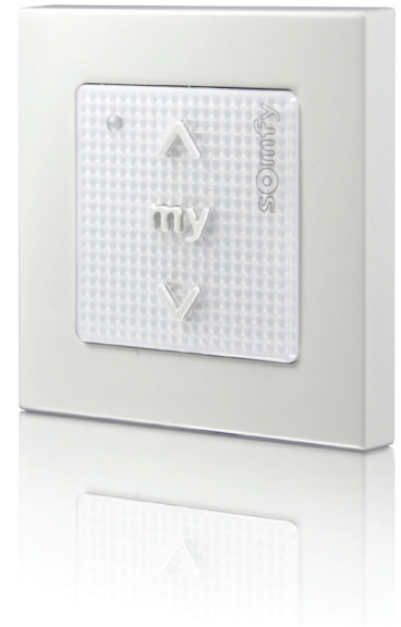
Smooove 1 RTS Pure Part #: 1811533

INTUITIVE, SURFACE-MOUNTED CONTROL FOR MOTORIZED WINDOW COVERINGS