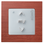
Cherry Part #: 9015236