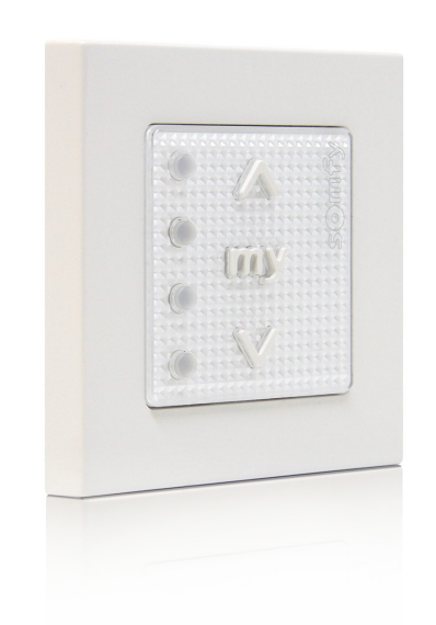
Smoove 4 RTS Pure Part #: 1811748

INTUITIVE MULTI-CHANNEL, SURFACE-MOUNTED CONTROL FOR MOTORIZED WINDOW COVERINGS